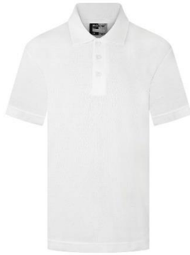
Plain White Po