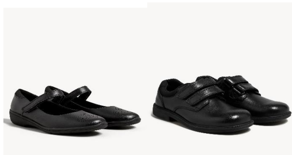
Plain Black Shoes