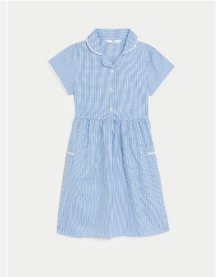
Blue/White Summer Dress