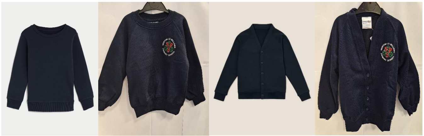
Unbranded Navy Sweatshirt