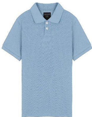
Blue Polo Shirt